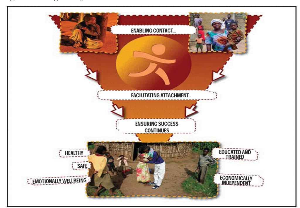
Figure 2: Reintegration of Children to their Families and Communities