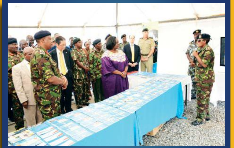
Head of Applied Research presenting on Applied Research