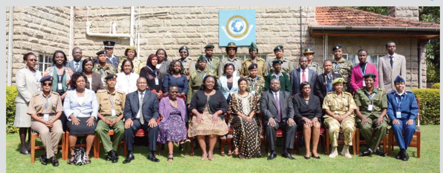
A group photo for Open Day Workshop: "Partners for Peace; Implementation on UNSCR 1325" held on 4 December 2014

The phrases 'UNSCR 1325 on Women, Peace and Security, the ground breaking resolution, and the land mark resolution,' are common among peace actors. This is especially so when the subject of discussion is 'gender and conflict'. It is however, not surprising if participants of such a discussion are found to be clueless when asked to shed more light on the provisions or content of UNSCR1325. So, what is UNSCR 1325?