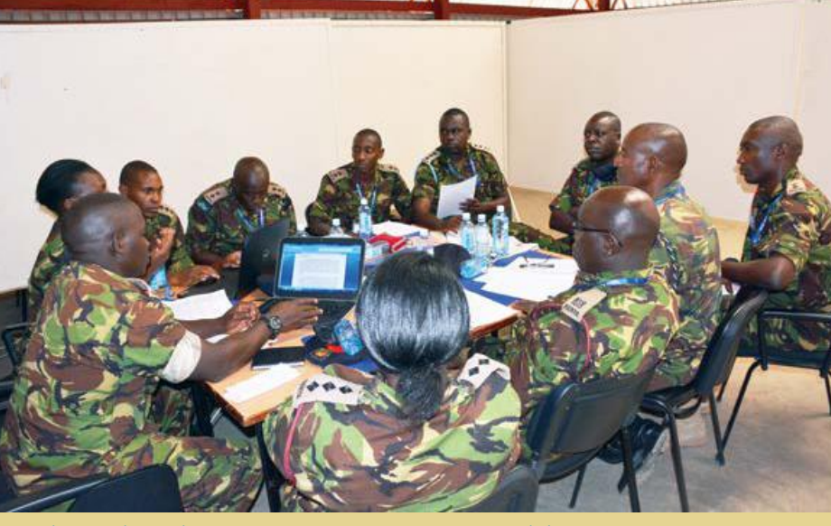
Syndicate discussion of Pre Deployment Course participants on 9th Mar 2015

South Sudan became independent on 9 July 2011 after a long period of 21 years of civil war. This new nation is amongst the poorest countries in the world and has been struggling to achieve lasting peace, unity, development and prosperity while engaged in a nation building process. However, some political and financial crisis