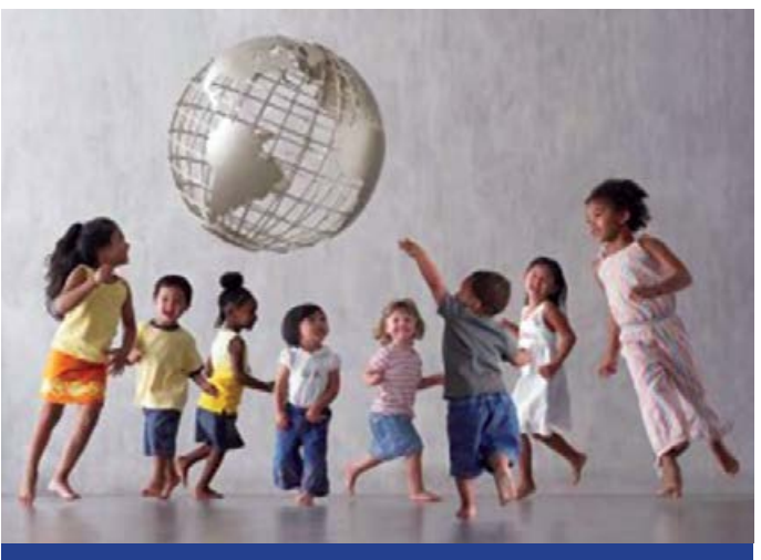
Children today are the world tomorrow.

The United Nations Convention on the Rights of the Child is an international document that sets out all of the rights that children have. The UN General Assembly adopted the Convention and opened it for signature on 20 November 1989 (the 30th Anniversary of its Declaration of the Rights of the Child and came into force on 2 September 1990). The Convention on the Rights of the Child has 54 articles with the full list of rights for children and young people under the age of 18 and is the most accepted standard