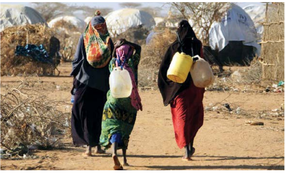
Women from a communal water tap in the outskirts of the Dagahaley settlement at Kenya's Dadaab Refugee Camp.

The UNHCR reports that Women and airls make up the majority of refugees consisting of up to half of those displaced over international borders. In addition, women refugees are the most affected by violence than any other population of women in the world. The most common form of sexual abuse is rape accompanied by other forms of Gender Based Violence (GBV) which are mostly under reported due to the void left by the civil society as a result of armed conflict. This is replicated in refugee camps where the majority population is comprised of women left to double up on their gendered roles with those of the head of the household. The social structure of women refugees is completely turned upside down as they settle to refugee life, mostly in a camp. Access to vital services like healthcare facilities exposes women rendered refugees to the risk of serious complications especially during pregnancy or delivery for what would be an otherwise routine birth.