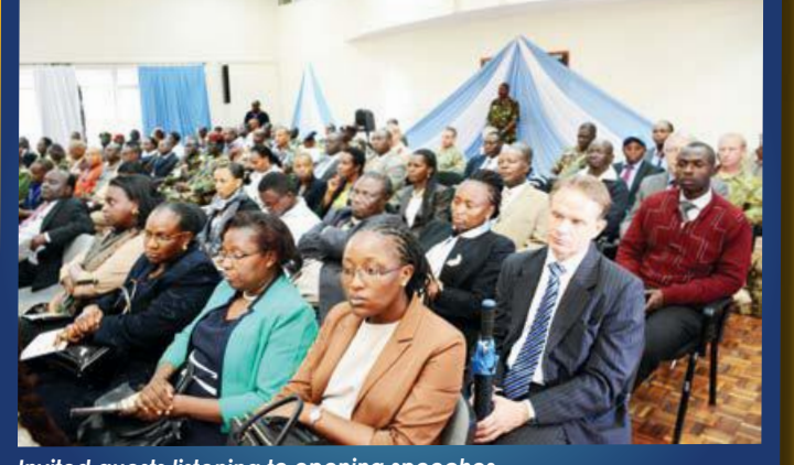
Invited guests listening to opening speeches