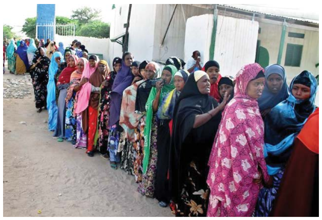
Somaliland women participate in voting in Hargeisa in June 26, 2010.

Though Somaliland's constitution grants women and men equal rights, the structure of the multiparty system present impediments to women political representation. This political structure is profoundly influenced by the clan culture, particularly the political parties. Traditionally women are not recognised as full members of their clans unlike men and political positions are dependent on clan support. A clan will not support a