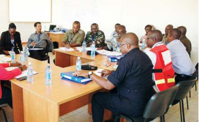
DRM course participants in a syndicate discussion

A Table-Top Exercise is a planned activity in which participants are presented with simulated emergency situation in exercise maps, photographs, plans models or written scenarios are used to simulate the scene and environs of an emergency. They are a cost effective and flexible means of testing plans, procedures and people.