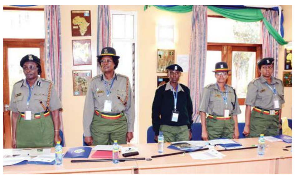
Correctional officers during a UN Women Open day Workshop at IPSTC on 4th December 2014

Over and over again, women have been considered guests at the negotiation table and in peace processes in general. A table that is often male-dominated despite the fact that women are more than half of the population in every census. Most notable male-centred peace processes in Eastern Africa include Naivasha talks for Sudan, Arusha talks for Burundi and Nairobi talks for Kenya to mention just a few.