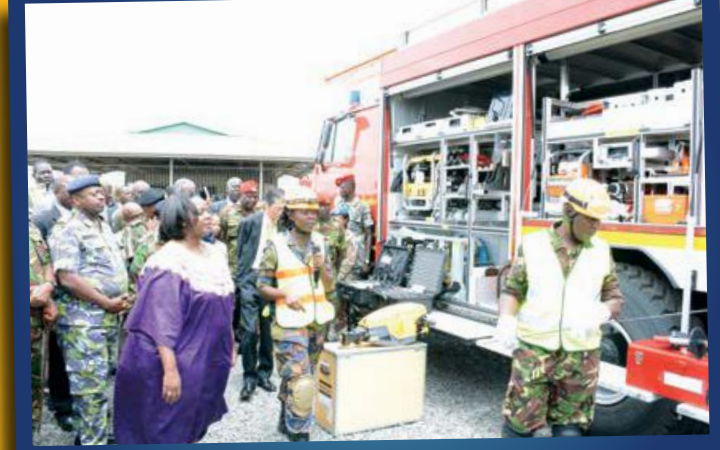
Disaster Response Unit display of firefighting equipment