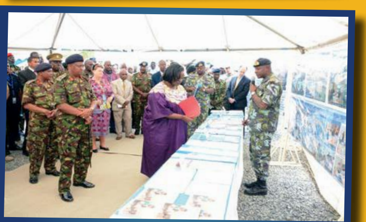
Peace and Conflict Studies School Display of materials used for training