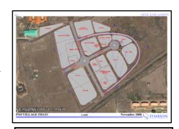
Diagrammatic view of the proposed PSO village

M R H Liddicoat RA Major SO2 Plans IMATC