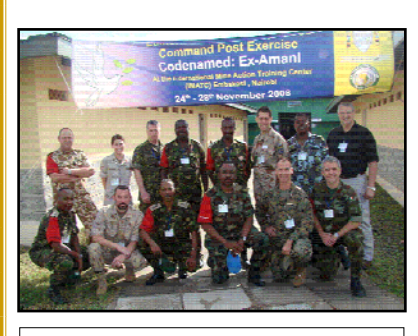
Exercise AMANI Evaluation Team