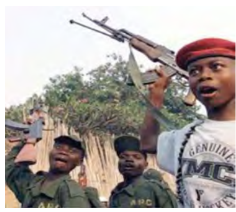
Child soldiers

conflicts are linked to SALW. In addition, more than 500,000 people globally are killed by SALW annually, with the majority being civilians. Global trade on illegal SALW is thrivina: it is estimated that its black market trade range from USD 2-10 Billion yearly, and that at least 1,134 companies in 98 countries worldwide are involved in production of SALW. Globally, about 7.5 - 8 Million SALW are estimated to be produced annually and civilians are reported to purchase more than 80% them. It is further reported that there are at least 639 Million small arms currently in circulation around the world and almost 60% of them are owned by private operators and civilians.