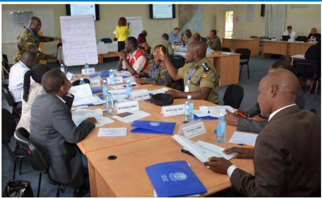
DRM training group discussion session at HPSS

and there is no clear evidence of serious problems. Incommensurable beliefs, or strong and definitive disagreement among groups about the nature of the problem and its consequent alternative solutions, deep rooted values and emotional loyalty are key contributors to resistance during transition period.