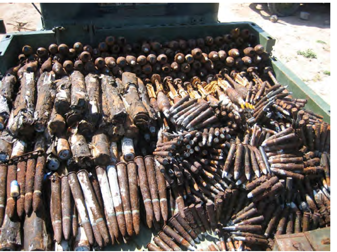
Small Arms and Light Weapons Removal