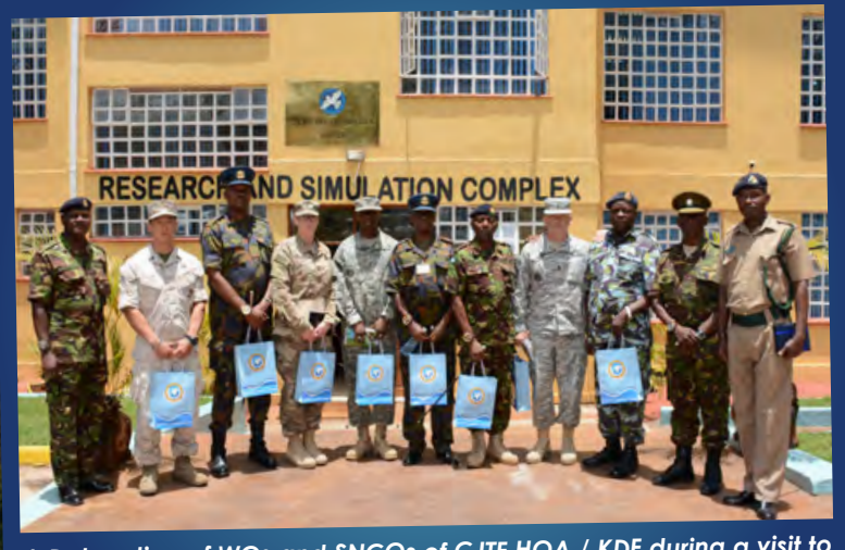
A Delegation of WOs and SNCOs of CJTF HOA / KDF during a visit to IPSTC on 16 September 2015