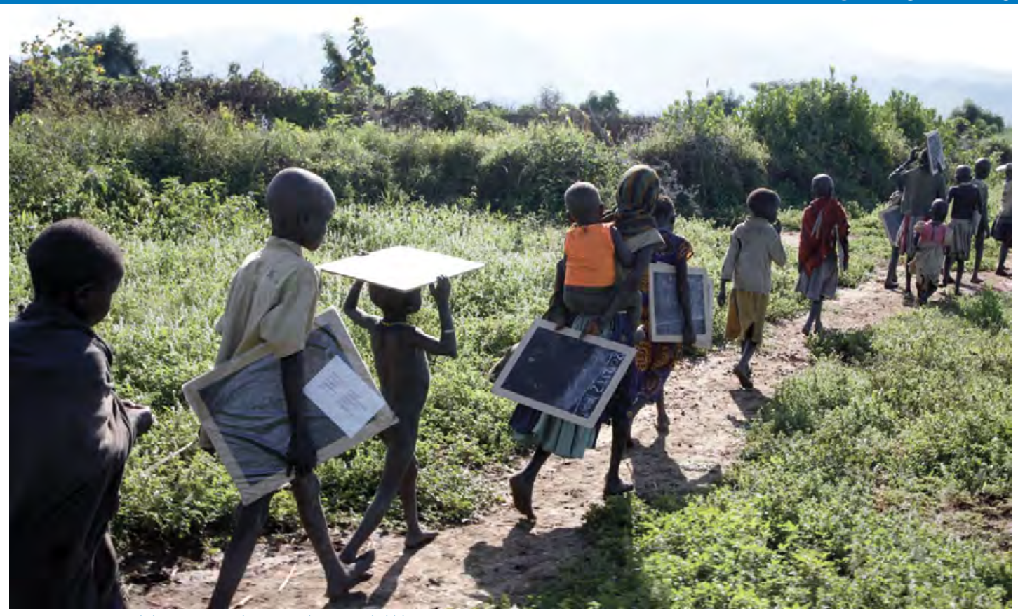
Thriving Karamoja: Creating possibilities together.

of traditional kraals and the advent of protected kraals in military barracks has removed the risk of large-scale inter-ethnic cattle raids and associated high death tolls and highway banditry. Women, children, and the elderly were the most vulnerable during raids and ambushes. In addition, women were prone to rape and even death as they travelled long distances in search of firewood, water, charcoal, wild fruits and vegetables. This has reduced as a result of government programs such as bore halls, dams and the restriction on the movement of men by the military as part of the government disarmament programme.