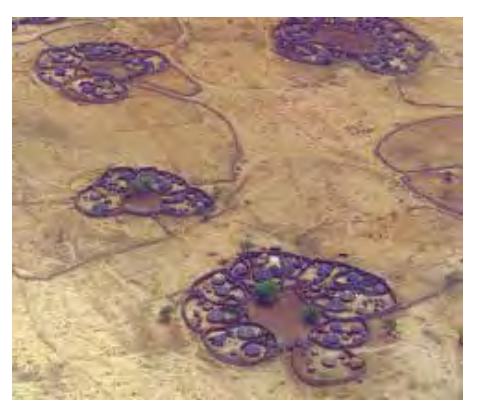
The 'ere' (kraals) in Karamoja; Cattle sleep in the centre surrounded by the households.

A new phenomenon in the region is the replacement of traditional kraals with the concept of protected kraals. Most animals are in centralized kraals protected by the Uganda Peoples' Defence Forces (UPDF) and Local Defence Units (LDU). The emergence of protected kraals has caused a shift in power dynamics from the warriors and kraal leaders to the military. The ramification of restriction on the movement of men by the military is associated with increased burden on the women and girls to provide for their families, especially during times of poor