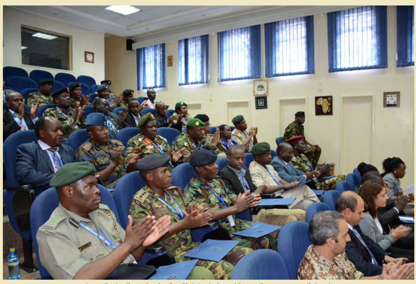
A syndicate discussion for Conflict Analysis and Prevention course participants

overall trend toward a reduction of violence since the end of the Cold War, there were 36 active armed conflicts in 2009 in Africa. Secondly, the imperative to protect local populations from continuing violence even in circumstances in which engagement may not lead to a resolution can address human rights and other humanitarian concerns, secure a presence in a conflict zone to monitor humanitarian conditions, and save lives.