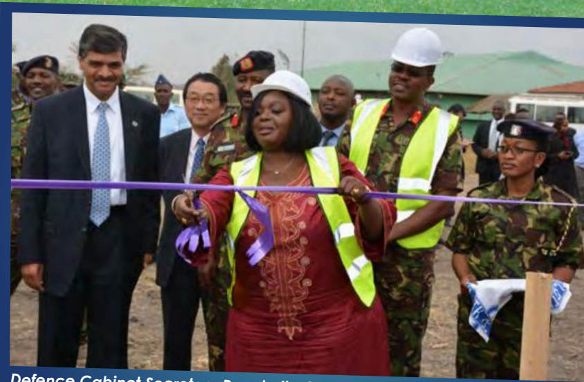
Defence Cabinet Secretary Raychelle Omamo Inaugurating the Triangular Partnership Project at HPSS on 7 September 2015