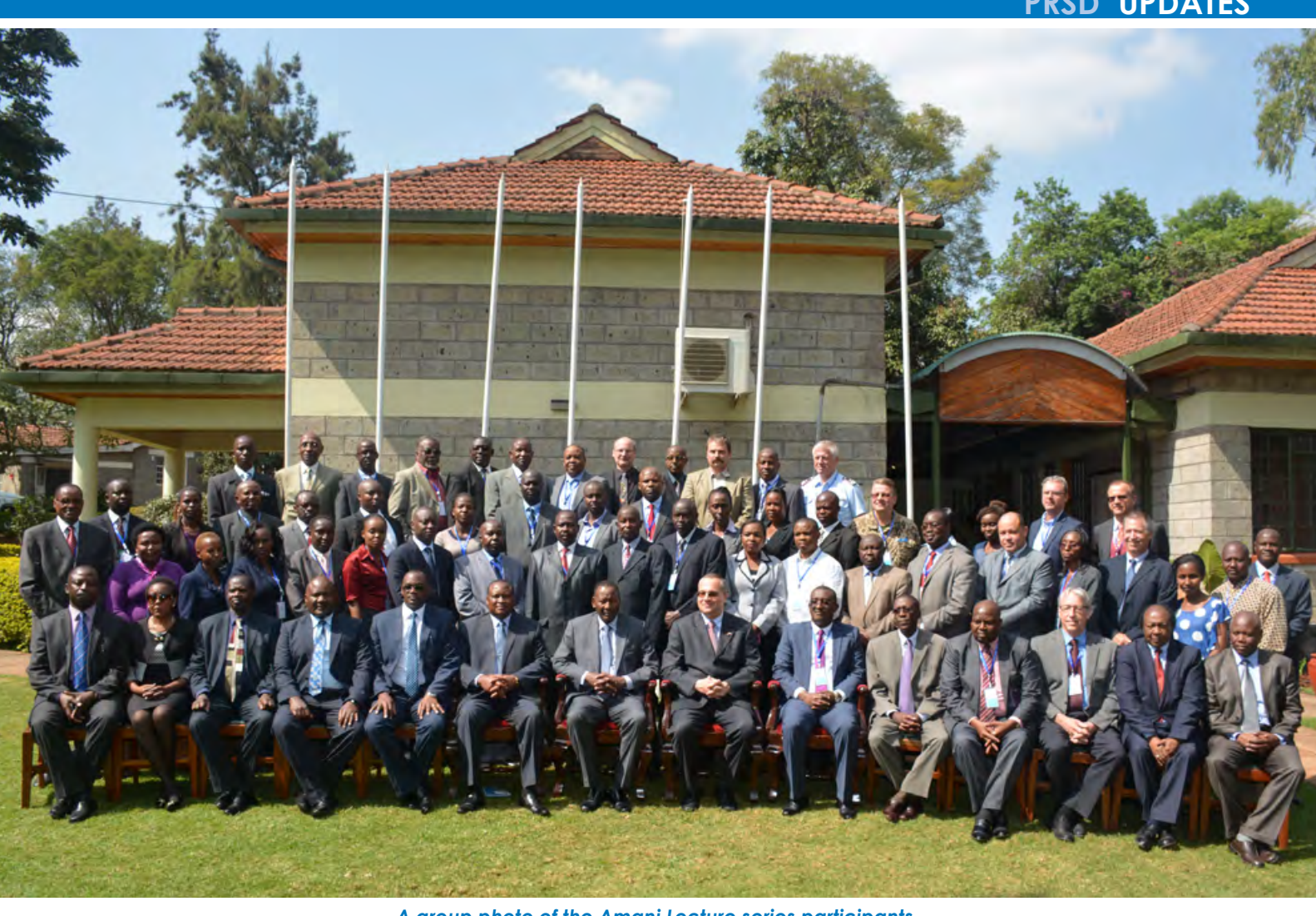
A group photo of the Amani Lecture series participants

people-centered manner where all stakeholders in the society come together in order to establish a society free from violence and SALW. Through this, the rule of law is strengthened and public safety and security safeguarded and promoted. In some cases, this can be done through Disarmament, Demobilization and Reintegration (DDR) in times of armed conflict. Practical Disarmament is not only confined to the physical removal of illicit SALW, but also addresses initiatives and actions meant to achieve peace such as social-economic transformation, and improvements in political governance and human security.