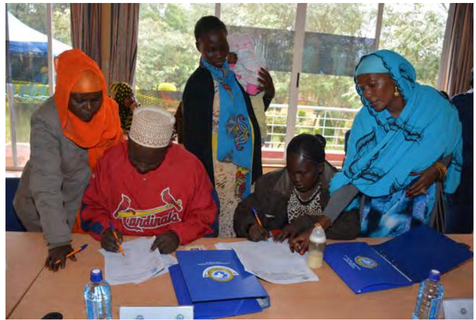
Community Peace Building Course participants on a group discussion