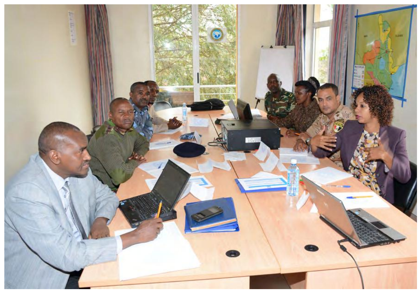
A syndicate discussion for Conflict Analysis and Prevention course participants

Recognizing the limitations of peacekeeping, especially as such efforts were becoming prevalent in the early 1990s, the UN Security Council convened in 1992 in a first-time meeting of Heads of State. The UN Security Council requested Boutrous Ghali to give analysis and recommendation that could strengthen peacemaking and peacekeeping during the post-cold war period especially in response to conflicts. The findings were contained