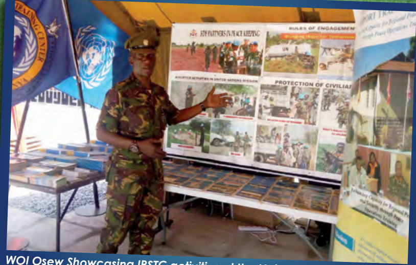
WOI Osew Showcasing IPSTC activities at the Nairobi International Trade fair 28 September - 04 October 2015