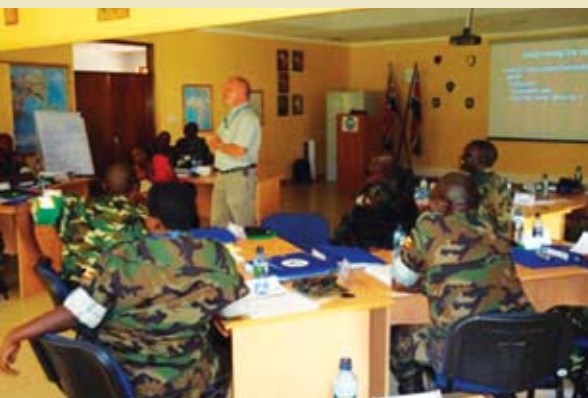
Students from TCC Uganda and Burundi along with AMISOM staff conducting a syndicate discussion

Directing Staff carried out all instructions and oversaw several syndicate exercises and presentations. This allowed key learning to take place since the DS were experts in the field of logistics as it relates to the AMISOM mission.