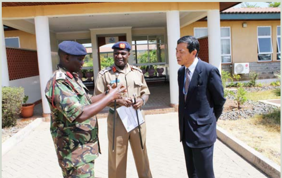
On the occasion of a visit by the Ambassador of Japan and UNDP Resident Representative to the Humanitarian Peace Support School on 9th February 2011.