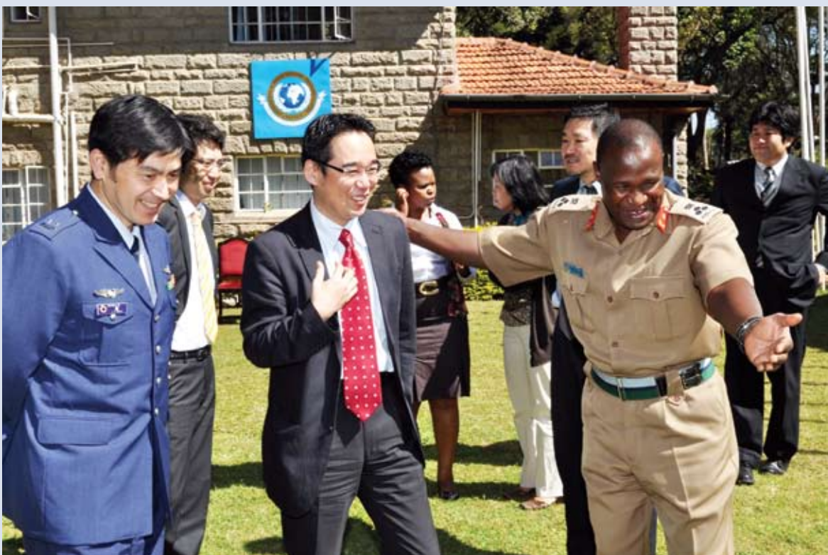
A delegation from Japan visiting IPSTC. They were given an orientation to the Training Management System.