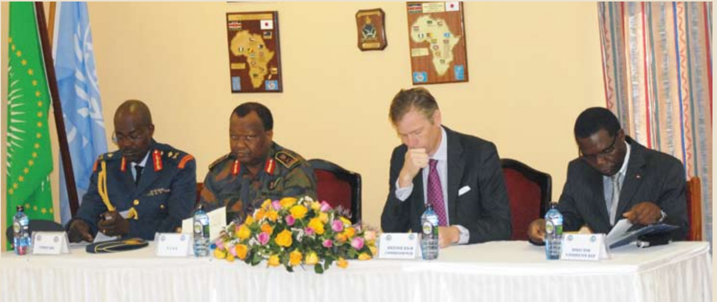
The dignitaries during the opening of the Senior Regional Mission Leaders' Course

The 4th serial of the IPSTC flagship course, the Regional Senior Mission Leaders' Course, was conducted at the International Peace Support Training Centre (IPSTC), Kenya, from Monday, 07 February to Friday, 18 February 2011.