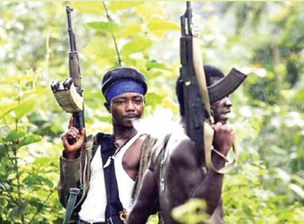
Years of conflict ... Liberian government soldiers on patrol in 2003.

International responses to specific conflicts are shaped by a range of competing priorities, including economic interests, counter-terrorism or humanitarian concerns. External actors are often divided on objectives and approaches. Too often, these actors respond in an uncoordinated or even counter-productive manner with actors working at cross-purposes. Competing agendas then risk creating confusing and duplicating efforts.