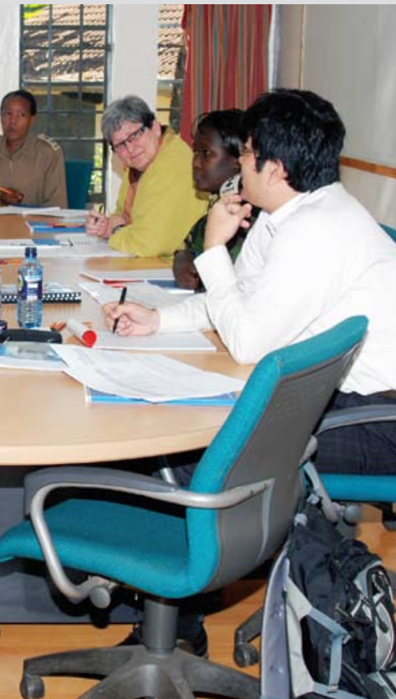
Participants during the Curriculum Development Workshop 26-28 Jan 2011