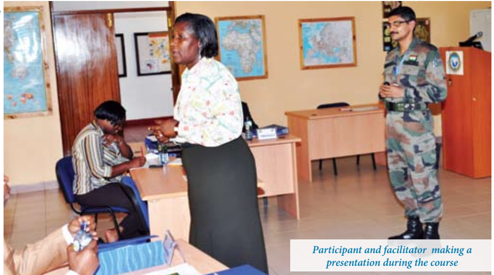
Participant and facilitator making a presentation during the course

The just concluded course brought together 22 participants from 12 countries in Africa and beyond and included Sudan, Kenya, Burundi, Uganda, Tanzania, Somalia, Comoros, Mali, India, Austria, New Zealand, and United States of America. Three peacekeeping missions, United Nations Mission in Sudan (UNMIS), African Union/United Nations Hybrid Operation in Darfur (UNAMID), and African Union Mission in Somalia (AMISOM) sent representatives to the course from departments of civil affairs, political affairs, and the Joint Mission Analysis Centre (JMCA) who shared experiences, best practice and the challenges they face in the field. The International Conference on the Great Lakes Region (ICGLR) sent representatives from some of their national focal points – Ministries of Foreign Affairs, Sudan and Tanzania - and personnel from conflict prevention and humanitarian assistance departments. From the Kenya National Steering Committee, participants came from the Ministry of Youth Affairs and Sports, Ministry of State for Provincial Administration and Internal Security, as well as from IGAD and peace monitoring