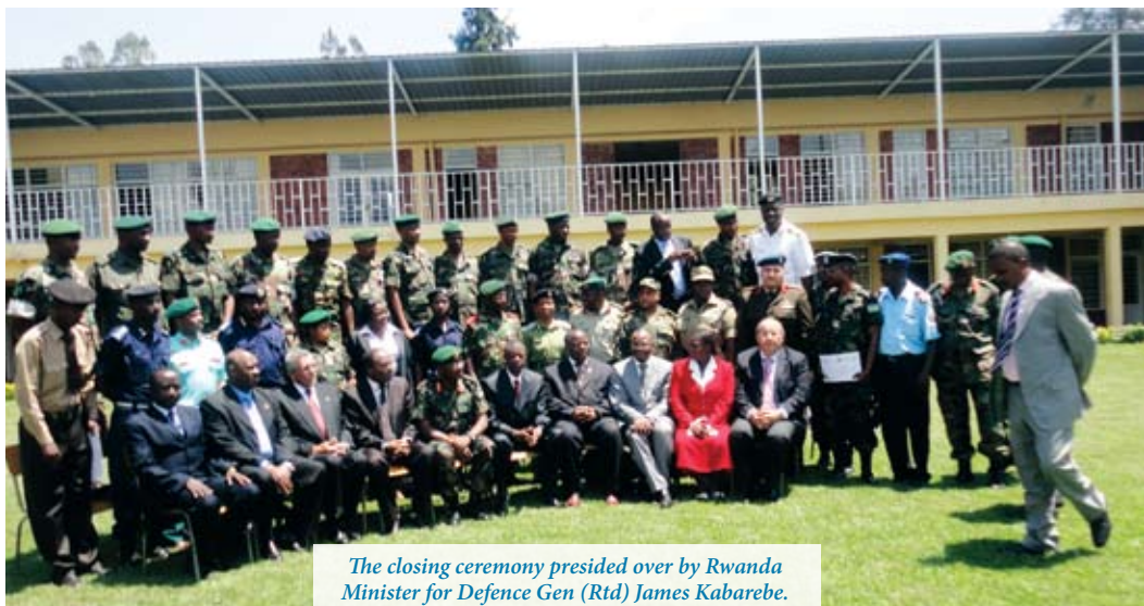
The closing ceremony presided over by Rwanda Minister for Defence Gen (Rtd) James Kabarebe.

The course covered the following major topics: the main types of conflict; different responses to conflict; proximate and structural causes; conflict trigger points; actors in a conflict who are the major parties of conflict, interests and positions; ethnicity and religion as major conflict motives; war economics and natural resource based