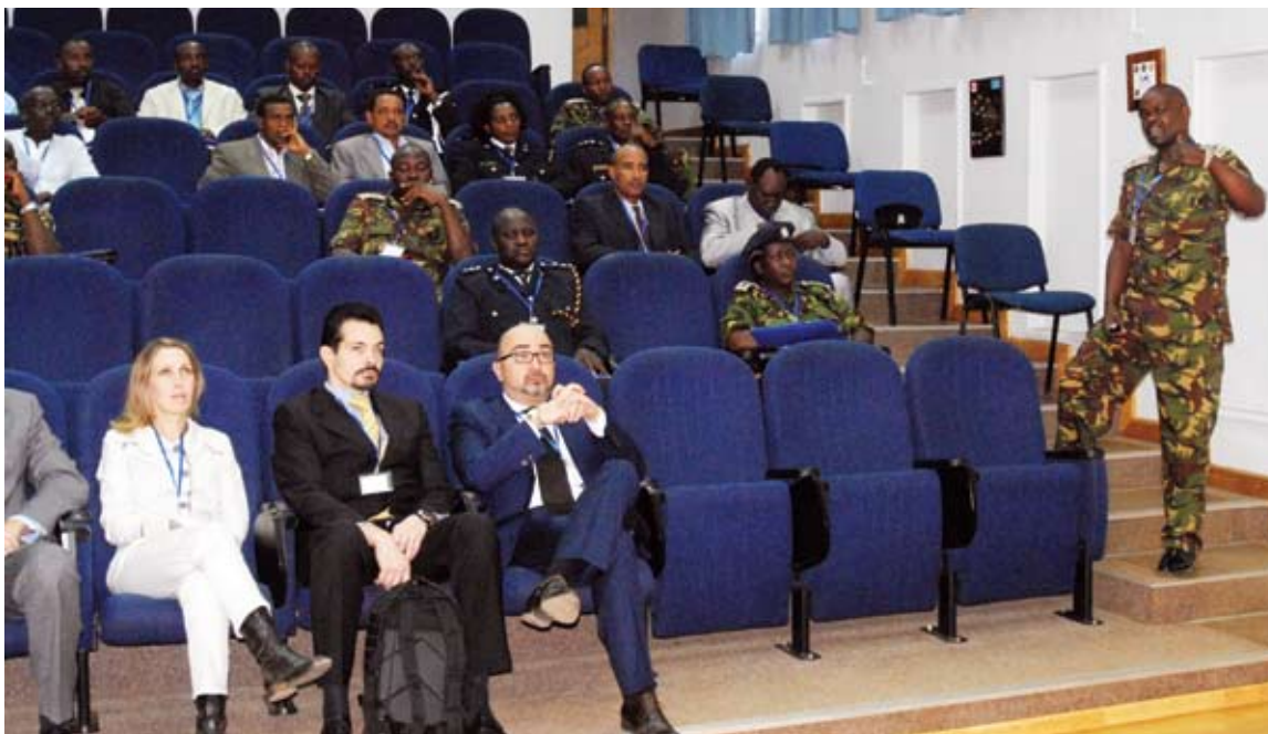
Participants during the Human Trafficking Course